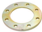
FLANGIA IN ACCIAIO ZINCATO PN 16 GALVANIZED STEEL FLANGE PN 16